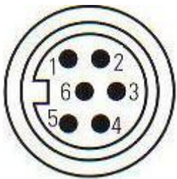
View from end of connector