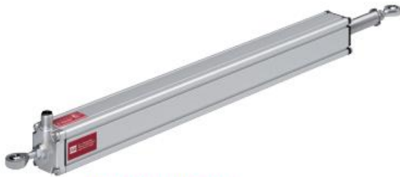
Model ER position sensor- Stroke Length: 50 mm to 1500 mm (2 in. to 60 in.)

Stroke Lengths : 50mm-1500mm (2in-60in) Outputs : A0 / V0 / Start.Stop / SSI / CanOpen / IO Link IP Rating : 67 Temperature : -40c to 75c Shock : 10G Connection : M12 5pin