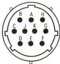
End of Cable